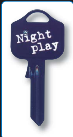
UL050DCW01 "NIGHT PLAY"