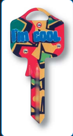
UL050DCW09 "I'M COOL"