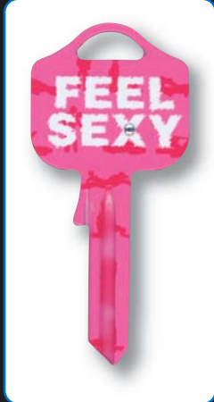
UL050DCW07 "FEEL SEXY"