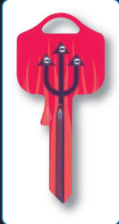
UL050DCW08 "I'M LIKE A DEVIL"