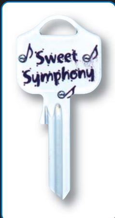
UL050DCW04 "SWEET SYMPHONY"