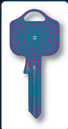
UL050DCW06 "FEEL CRAZY"