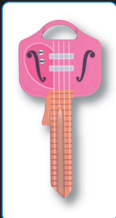
UL050DCW02 "MY MELODY"