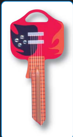
UL050DCW03 "I'M A ROCKER"