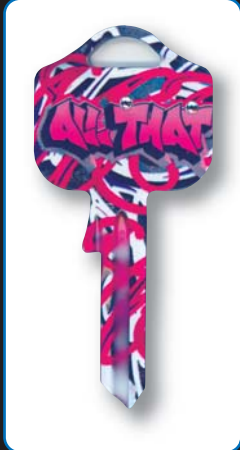
UL050DCW12 "ALL THAT"

In compliance with current regulations relating to industrial property, we hereby state that the trade-marks or trade names mentioned in this document are the exclusive property of authorized manufacturers of locks and keys. Said trade-marks or trade names are mentioned only for the purposes of information so that any lock, for which our keys are made can be rapidly identified. This document is reserved exclusively for professional key cutters who use Silca products. All information and illustrations in this document are for guidance only. Silca reserves the right to alter products designs, dimensions or to improve the products quality. The contents of this document are fully protected by Copyright and may not be copied or reproduced in any form. Any infringements will be dealt with under Italian law.