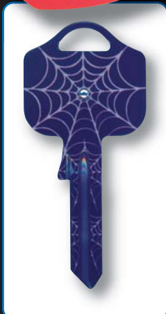
UL050DCW05 "FEEL DARK"